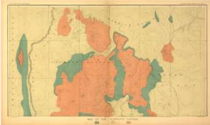
Atlas Sheet VII

[ Note: Sheets VII–VIII comprise halves of one map.]