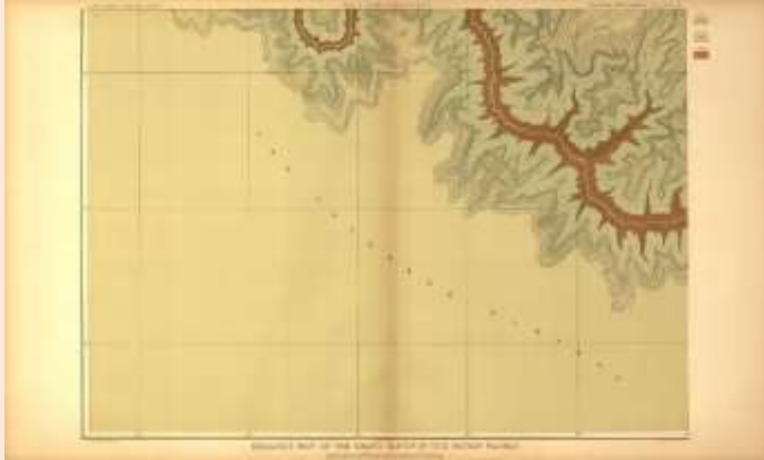
Atlas Sheet XIII