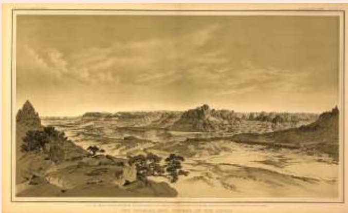
Atlas Sheet IV

["The topography is the same as that of the preceding sheet." ( from Sheet I)]