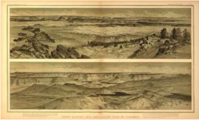
Atlas Sheet IX