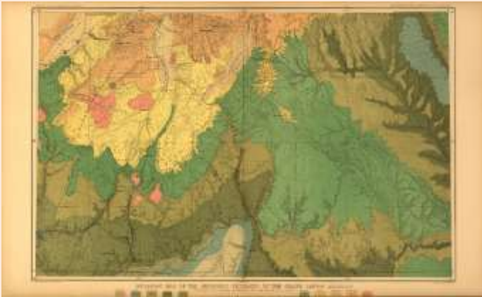
Atlas Sheet XXI