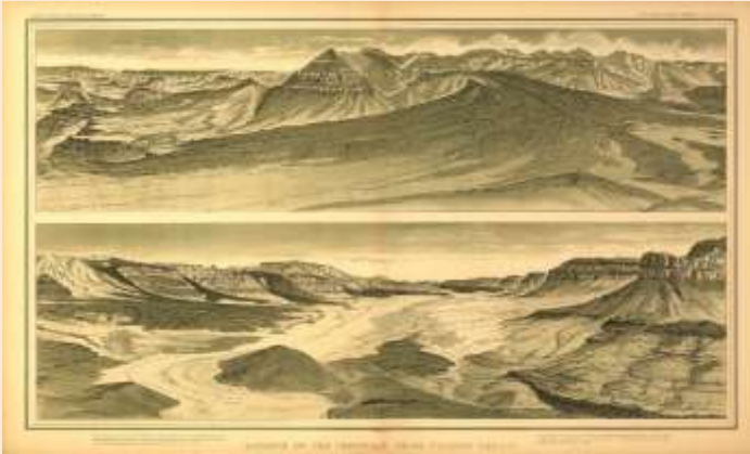
Atlas Sheet V

Looking Up the Toroweap From Vulcan's Throne [Two panoramic views] [Drawn by William H. Holmes]