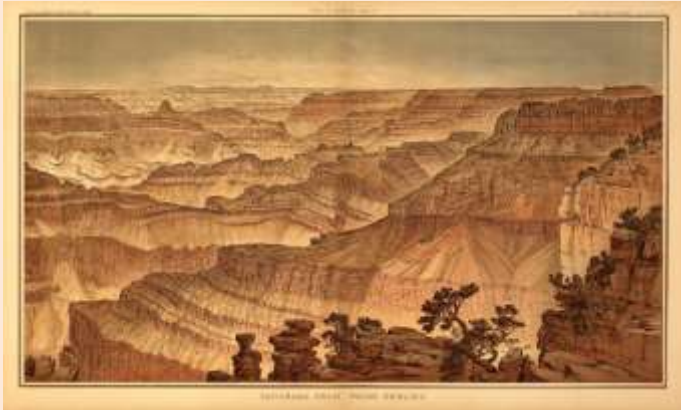
Atlas Sheet XVII