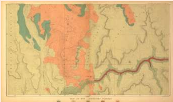
Atlas Sheet VIII

[Geologic map, scale 1:63,360; colored] [Topography by J. H. Renshawe; geology by C. E. Dutton]