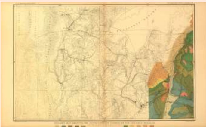
Atlas Sheet XX

[Two panoramic views] [Drawn by William H. Holmes]