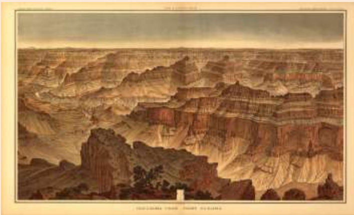
Atlas Sheet XVI