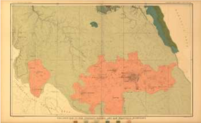
Atlas Sheet XXIII