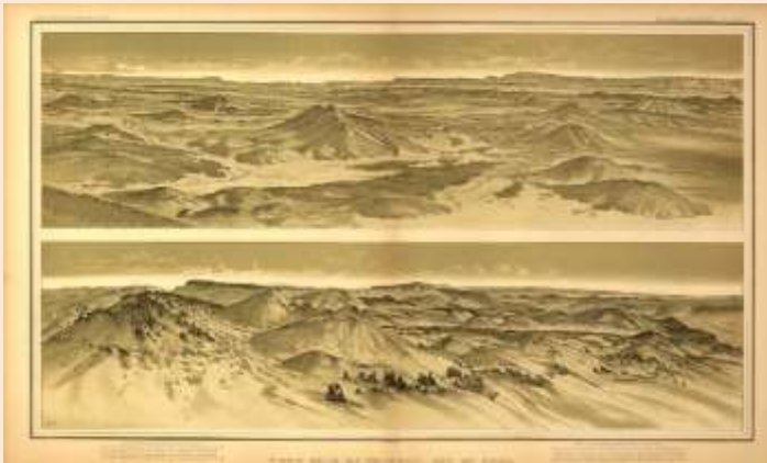
Atlas Sheet X