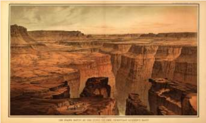
Atlas Sheet VI

Looking Up the Toroweap From Vulcan's Throne [Two panoramic views] [Drawn by William H. Holmes]