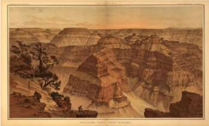
Atlas Sheet XV

[ Note: Sheets XV–XVII comprise thirds of one panoramic view.]