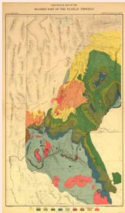
Atlas Sheet II

[This summary list does not always reproduce the titles as shown on the Atlas sheets. It also groups some sheets together.]