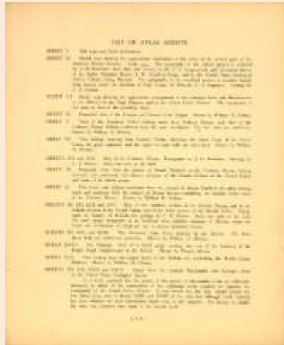
Atlas Sheet I

TITLES AS PRINTED ON ATLAS SHEETS ARE SHOWN HERE IN BOLD