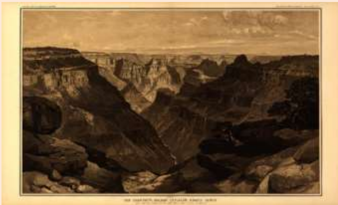
Atlas Sheet XVIII