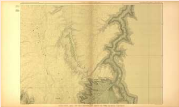
Atlas Sheet XII

[Scale 1:63,360; colored] [Topography by Sumner H. Bodfish; geology by C. E. Dutton]