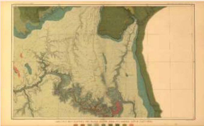
Atlas Sheet XXII

[Scale 1:250,000; colored] [Geology by C. E. Dutton]