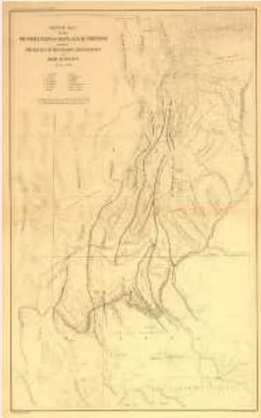
Atlas Sheet III