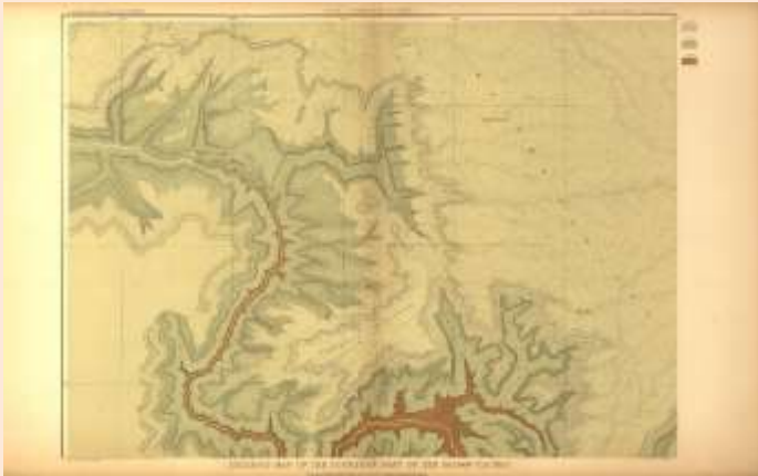
Atlas Sheet XI

[ Note: Sheets XI–XIV comprise quadrants of one map.]