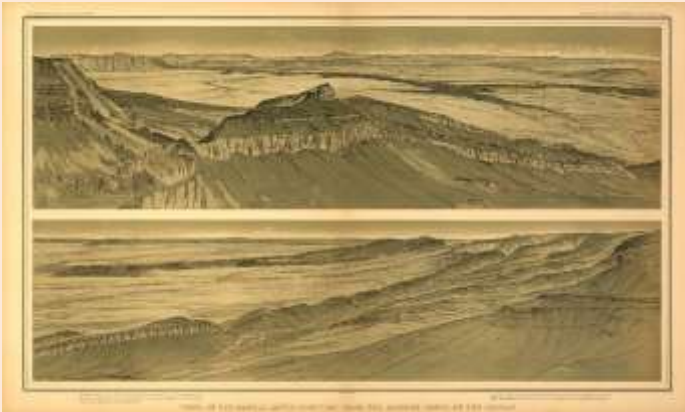
Atlas Sheet XIX