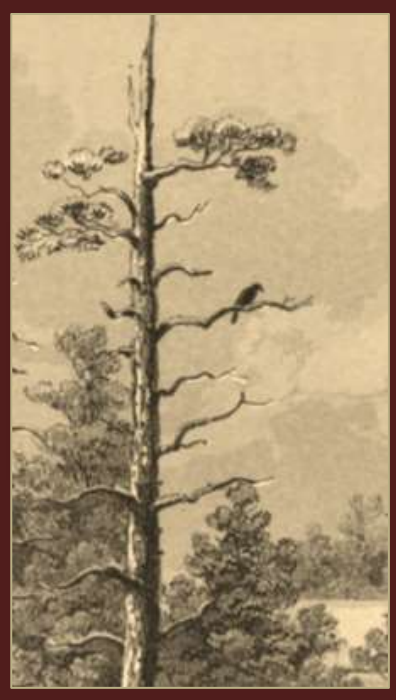
A Raven's Perch Digital Production