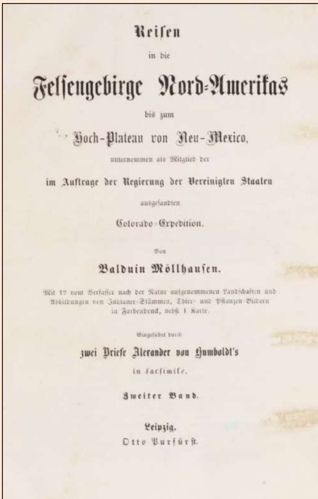
Otto Purfürst imprint [1860?]. Volume 2 is shown.